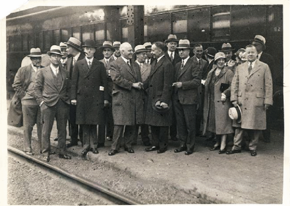
Members of the Rotary Club of Winnipeg travel by train to a district conference in 1932.

This story originally appeared in the January 2026 issue of Rotary Canada magazine.